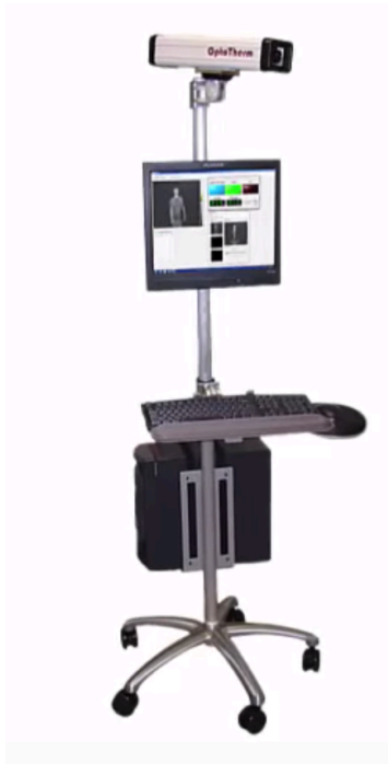
Our US Partner System