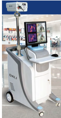
Our China's Partner System